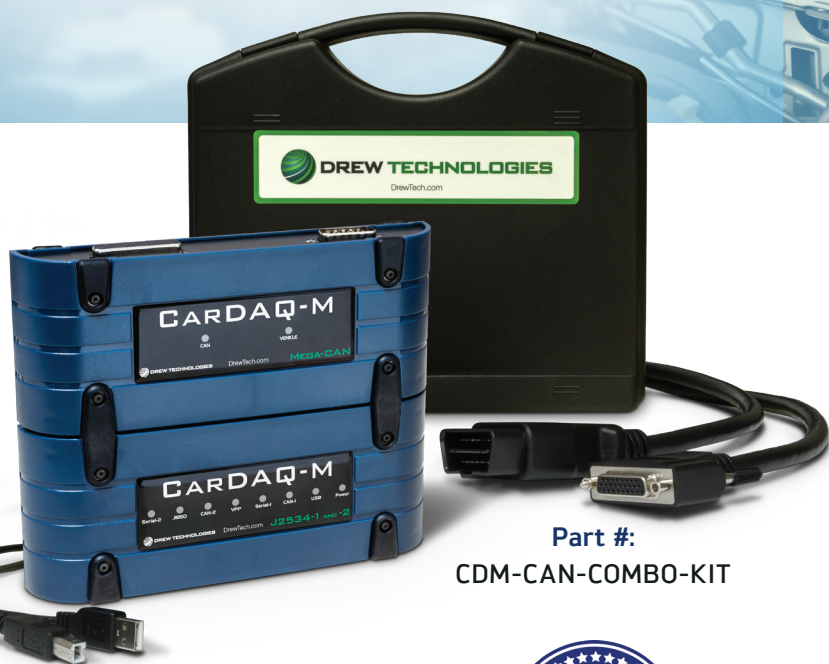
Part #: CDM-CAN-COMBO-KIT